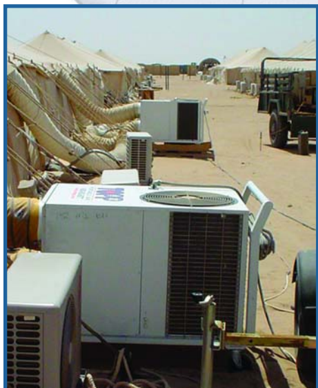
Helping to cool the troops in Kuwait.

Manufacturing - The MOB-42-HP can be used to cool machinery in production areas, spot cool employees or cool down manufacturing processes.