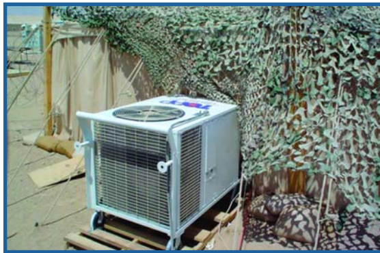
Cooling our troops in the Middle East.

Equipped with a 50-foot power cord, other features of the MOB-42-HP include 1 supply and 2 return air duct adapters. These features, plus optional remote thermostat and condensate removal system, make the unit ideal for diverse heating or cooling needs.