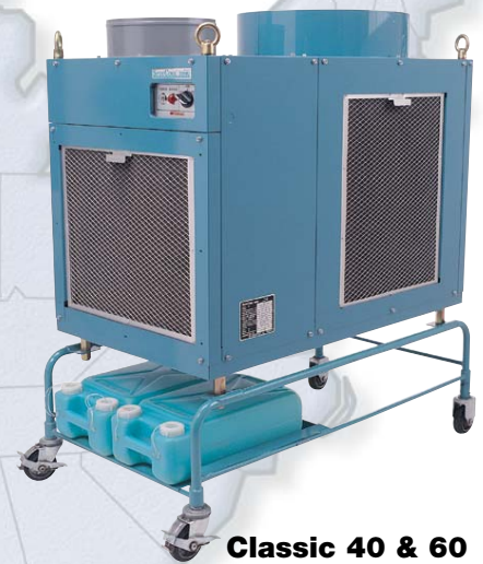
Classic 40 & 60